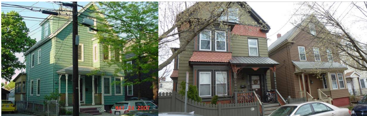
Top: 4 West Street, 31 Madison Street, 9 Hersey Street Middle: 11 Hathorn Street, 32 Knowlton Street, 21 Vinal Avenue Bottom: 33 Madison Street, 43 and 41 Quincy Street

If the Commission determines that the demolition of the significant building or structure would be detrimental to the architectural, cultural, political, economic, or social heritage of the City, such building or structure shall be considered a preferably preserved building or structure. (Ordinance 2003-05, Section 4.2.d)