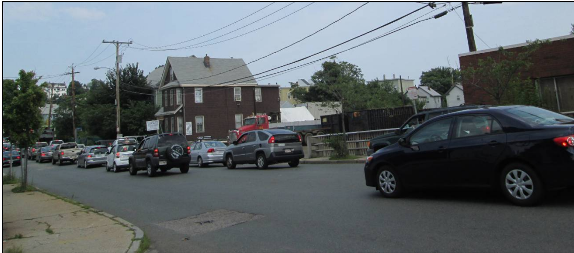
Prospect Street, looking north toward Prospect Hill

A letter dated August 6, 2014 from the MHC notes that the properties at 4 Milk Place, 26-28 Prospect, and 30 Prospect are included in the MHC “Inventory of Historic Assets;” however, none of these buildings are listed in the State Register, nor do they appear to meet the criteria of eligibility for listing.